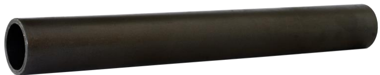
Product order code: 600 000 103