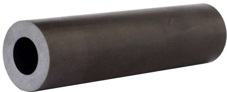
Product order code: 600 000 128