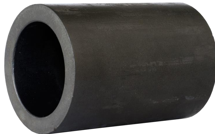
Product order code: 600 000 250