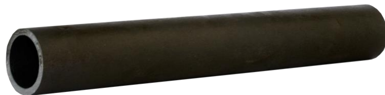
Product order code: 600 000 114